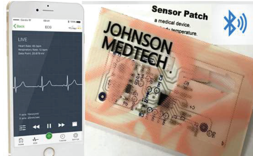
Printed electronics in Dayton, Ohio