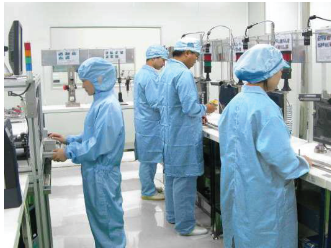
Electromechanical products in Shenzhen, China